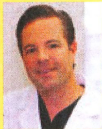
Your Catholic Dermatologist